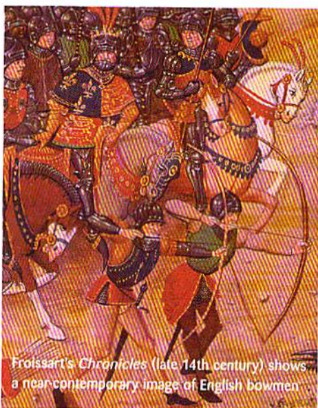
Froissart's Chronicles (late 14th century) shows a near-contemporary image of English bowmen

Back in Nottingham, Henry heard rumours that Northumberland was tacking towards Wales, not Scotland. The king knew Hotspur was in Chester busily recruiting soldiers, and that Mortimer and Glendower were somewhere in Wales raising their levies. He also knew that Worcester, acting as the rebellion's treasurer, had stolen funds from the Prince of Wales's headquarters in Shrewsbury. Hoping to defeat