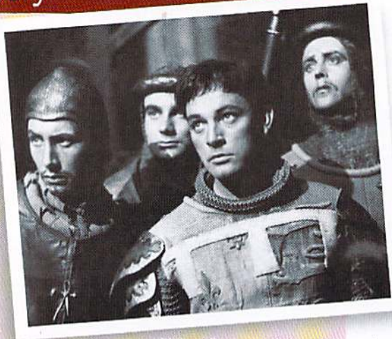
Richard Burton as Prince Hal in the RSC's 1951 production of Henry IV Part 1

Much of the play is taken up with the build-up and preparation for the battle. The battle itself is depicted as a series of one-on-one encounters (the limitations of the stage preventing any scenes of mass combat). The deaths of thousands of archers and foot soldiers isn't commented on. It's the deaths of the nobility that provide the tragedy. However, this shouldn't surprise us, as even up until the last century the ruling classes have had scant